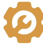
Web Design & IT Companies