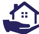
Real Estate, Rental and Property Management Companies